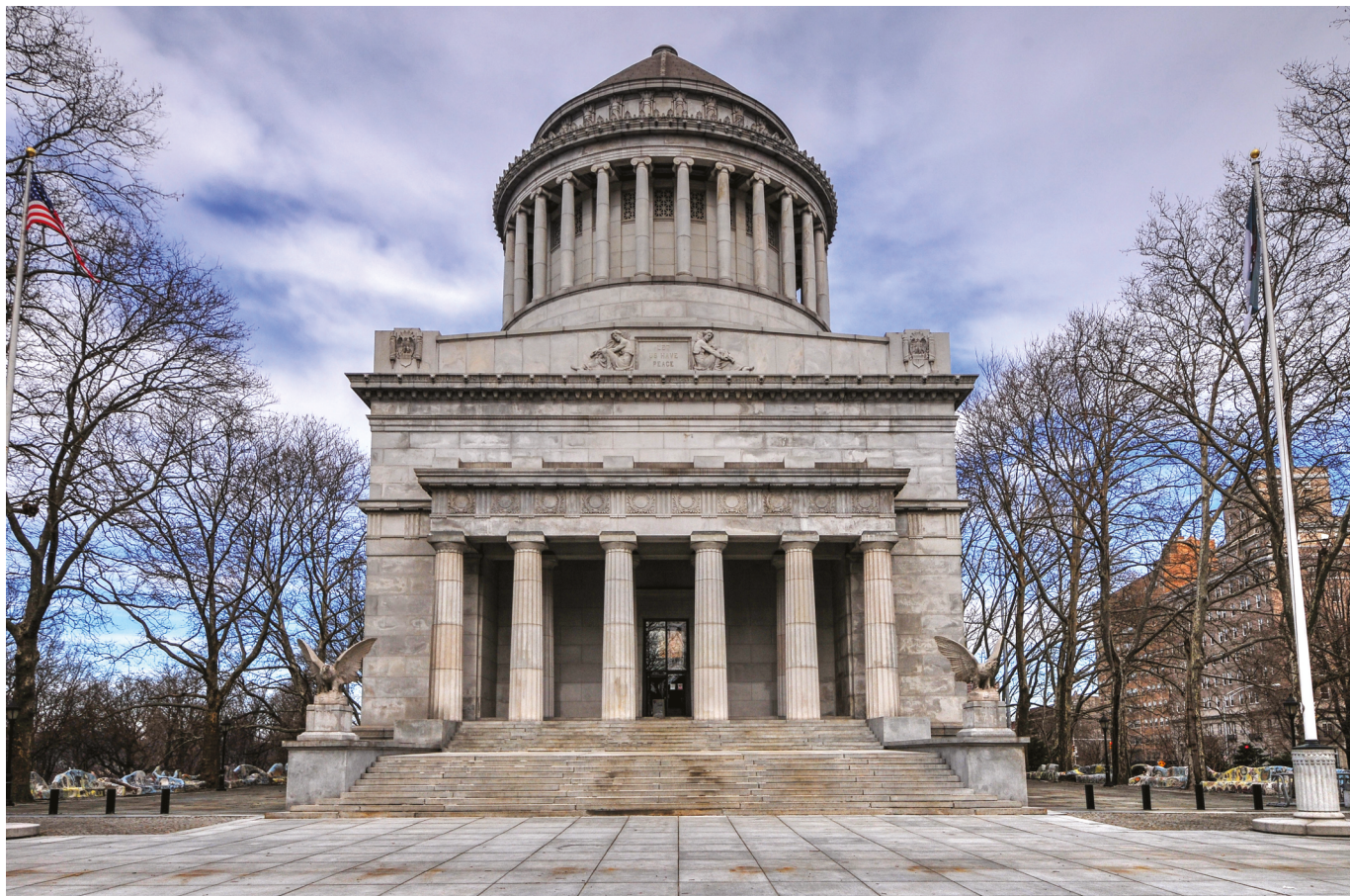
Figure 3: John H. Duncan, The General Grant National Memorial , 1897, stone (Manhattan, New York, USA)