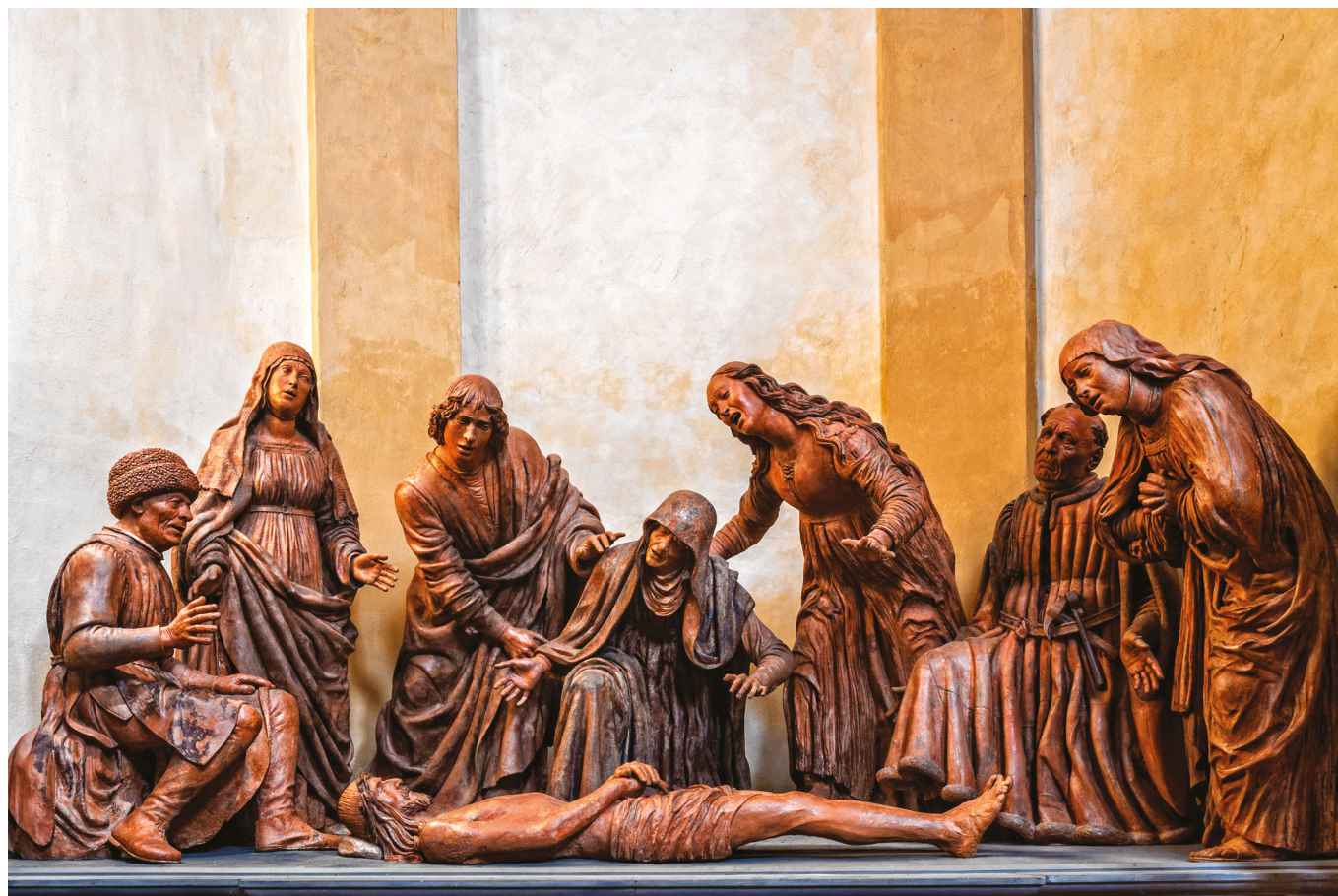
Figure 2: Guido Mazzoni, Lamentation over the Dead Christ , 1477–80, terracotta, lifesize, (San Giovanni Battista, Modena)