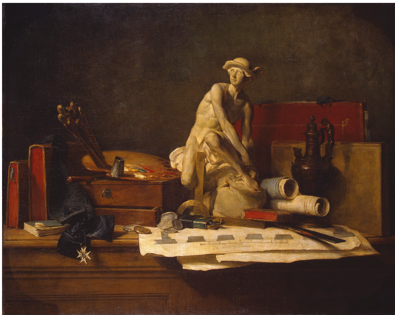
Figure 1: Jean-Baptiste-Siméon Chardin, Still Life with Attributes of the Arts , 1766, oil on canvas, 112 × 140.5 cm (State Hermitage Museum, St. Petersburg)